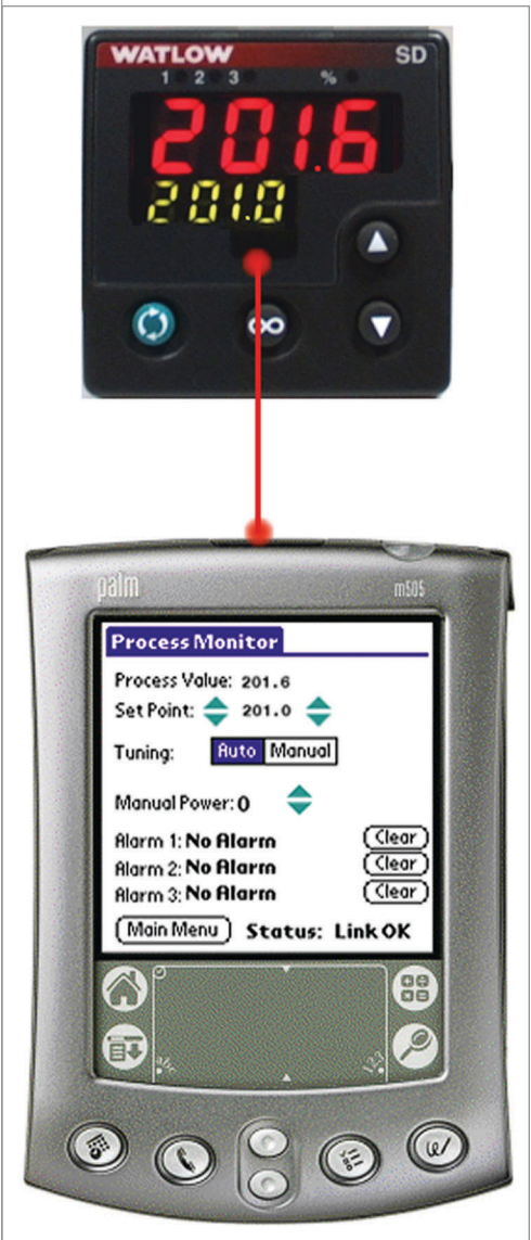
Figure 4 shows an example of IrDA protocol in action.

Figure 4 shows an example of IrDA protocol in action. Application 1 (InstantHMI incorporating an infrared communication driver) running on a Palm PDA that is beamed at the IR transceiver of a Watlow SD controller running Application 2 (Watlow SD firmware incorporating a complementary infrared communication driver). The communi-